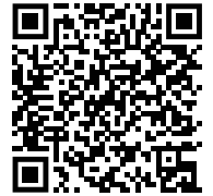
Scan for more info.